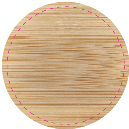
Front - print area