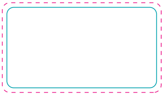
Rear with badge fixing